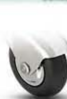
Soft Neoprene Rubber